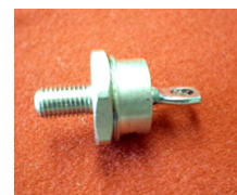
1N4510 Standard Rectifier (trr More Than 500ns)